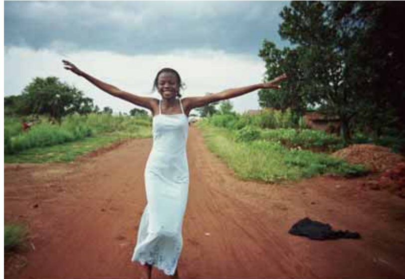
I believe I can fly

I took it because I know one day, one time I will fly and travel in some countries... I also know that I can work hard in order to get my goals. Even if my parent dead I know I will fly through photography.