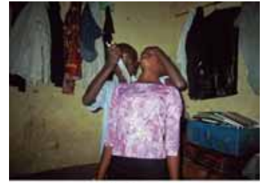
Here I thought... After some time passed in my mind I was not so worried to picture that with a book.